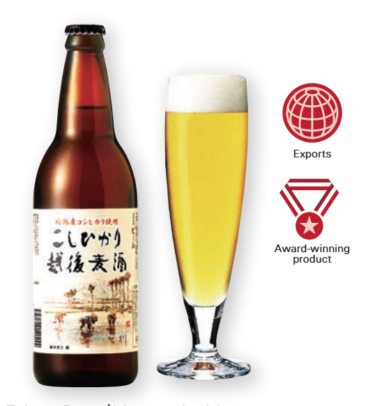
Echigo Beer/Niigata-shi, Niigata

Aza-kawakubo 54-2, Kanaya, Tamura-machi, Koriyama-shi Fukushima 963-0725 TEL:+81-24-943-2380 FAX:+81-24-944-6859 http://www.e-horaiva.com/