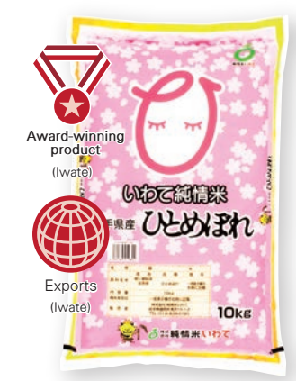
Hitomebore from Iwate. The package design vary by selling agency.